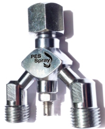
P-Y connector 1/4 P-Y connector 3/8